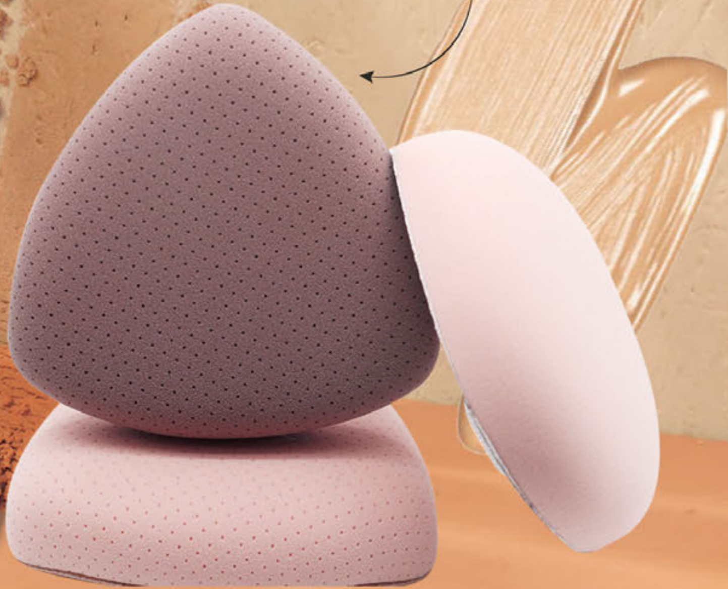
Marshmallow Touch Puff

SKU.NO: 202210638 Material: PU+rubycell Size: 68*68mm